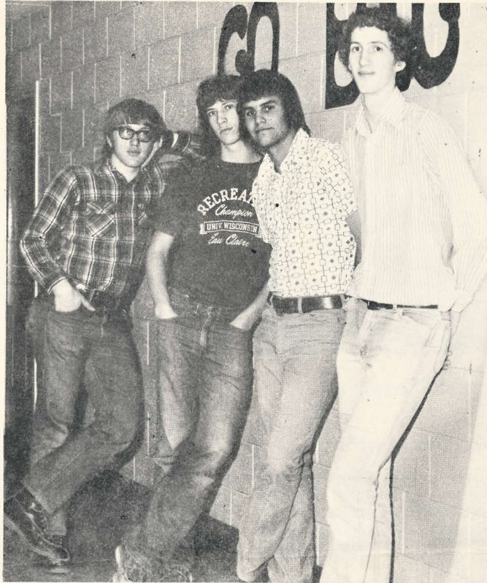
Our Super Senior Stars

Frederic faced Unity in the second game of the night. This was the toughest game of the tourney and a very low scoring game. The lead was tossed from one to the other after baskets and baskets went in. The game ended with a big victory for Frederic over Unity 41-40.