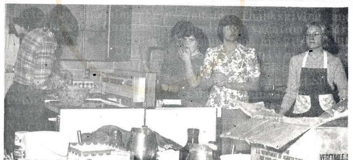
Christmas Tea Preparations