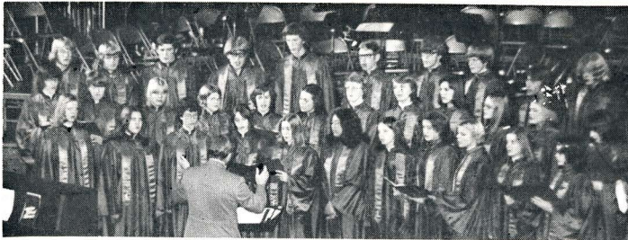
Glee Club in Performance