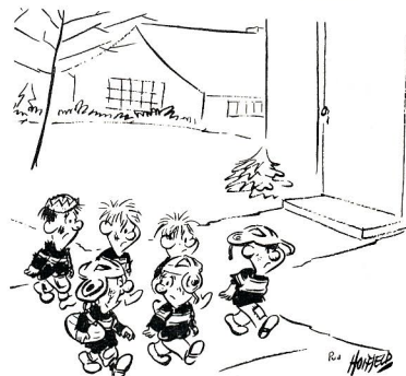
"If anyone asks, just say we lost. Period! Nobody has to know the MS Wildcats are girls."