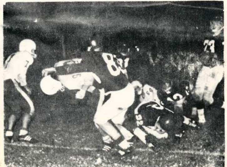
FOOTBALL ACTION: GO TOUGH, CARDS !!!

Hey Bobby- Is it true your car will get 203 feet of rubber?