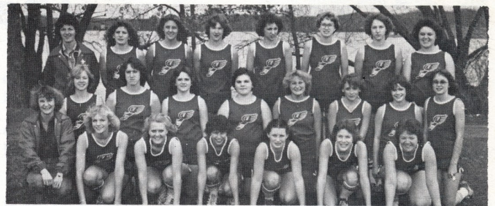
Luck Girls Tracksters