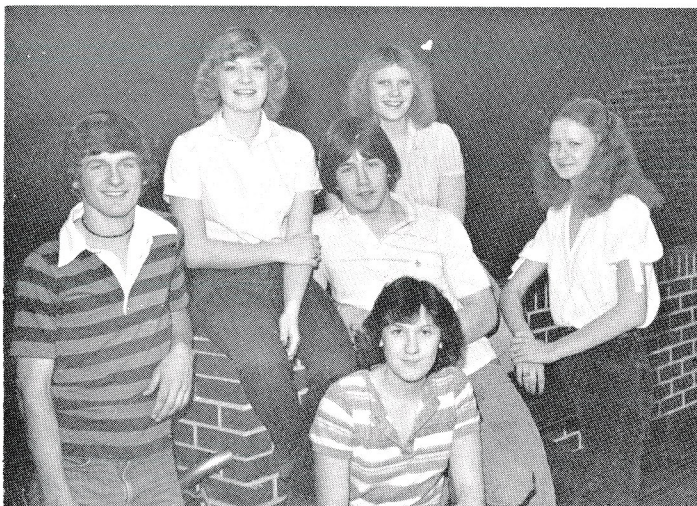
Prom Committee Hosts Successful Prom